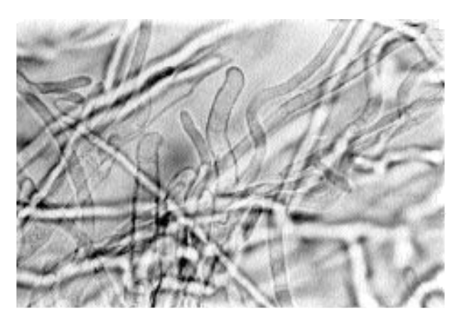
Figure 2. Helically twisting macroconidia formed among helically twisting hyphae of aberrant Trichophyton rubrum isolate (1000x).

Non-soil-associated dermatophytes in most cases have lost the ability to produce, or at least to regularly produce, one or both types of aleurioconidia. A substantial number of anthropophiles, such as Trichophyton concentricum and T. schoenleinii, never or seldom produce aerial conidia of any kind. The attenuation of the abundance and diversity of conidial production is readily seen in all asexual zoophiles and anthropophiles. For example, only a very small minority of the common T. rubrum isolates produce macroconidia, and, while some isolates produce copious microconidia (also sometimes abundant aerial arthroconidia), many isolates even produce few or no microconidia. The same is true of the cattle ringworm fungus, T. verrucosum. The effective propagation of most anthropophilic fungi, as Aljabre et al. [26] and others have elegantly demonstrated with anthropophilic T. mentagrophytes, is essentially entirely accomplished by substra-